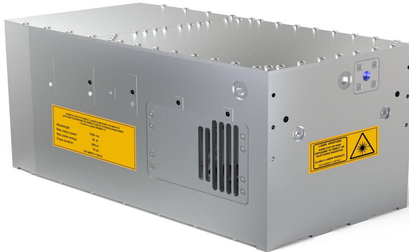
Figure 1: Lambo laser head including driving electronics and air cooling fans.

Bright Solutions is glad to introduce Lampo , the new family of compact ultrafast lasers generating high peak power ps laser pulses at a repetition rate selectable over a wide frequency range, externally triggerable from 50 kHz to 40 MHz.